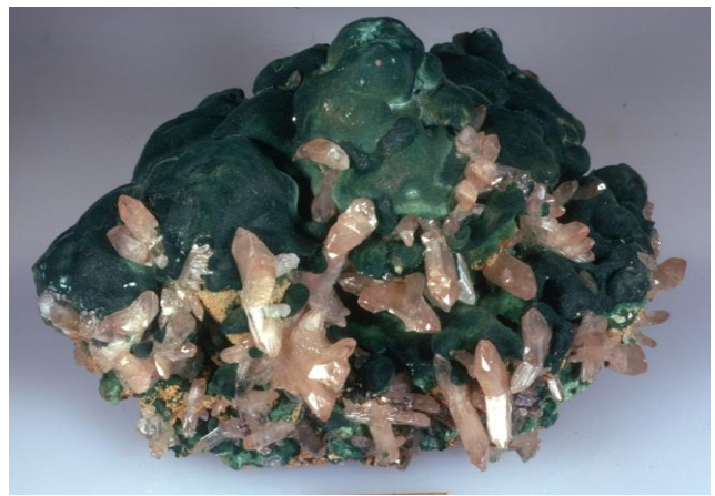
D. Pohl specimen collected 1973