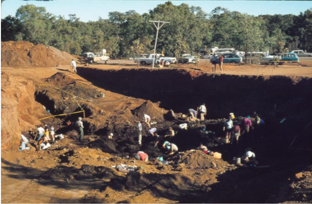
Collecting in the 1977 excavation.