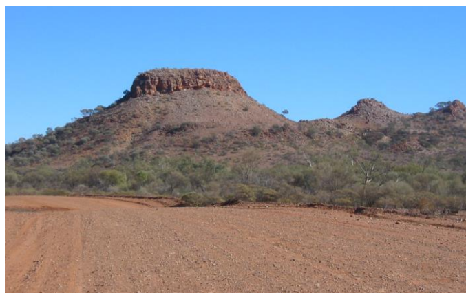
Silicified, (silcrete) cappings. Bacon Range N.T.

Ferruginisation is the weathering solution of ferrous iron ( \text{Fe}^{2+} ) under reducing conditions, mobilisation and precipitation of ferric ( \text{Fe}^{3+} ) oxides and oxyhydroxides under oxidizing conditions. Silicification occurs during periods of wetter climatic conditions and marked chemical weathering under alkaline conditions, silica released into solution can re-precipitate to silicify rock materials and regolith, particularly as resistate silcrete. Calcification occurs under semi-arid and alkaline evaporitic conditions. Calcium in solution can react with bicarbonate ions to form calcite-dolomite (calcrete) deposits, which can also act as resistate layers.