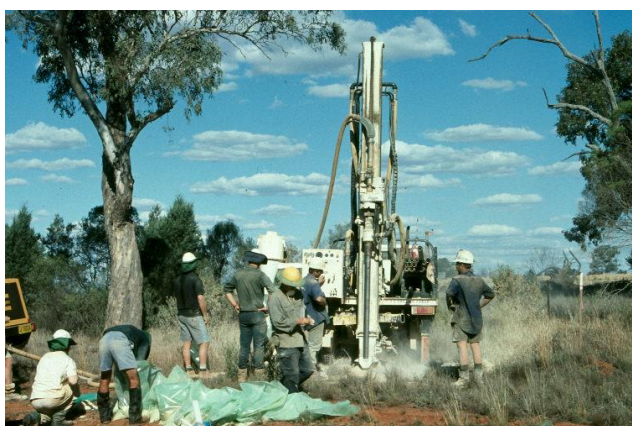
Regolith sampling in the Cobar Region, western NSW.