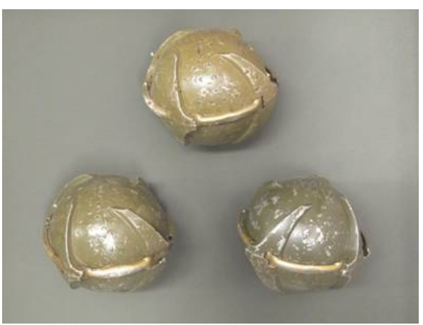
One-pound 'bomblets' each containing 600 razor-sharp steel shards

The resourceful Laotian people have not been slow to make use of some of the discarded American ordnance and a number of images were shown of bomb and shell casings converted into plant holders, a child's bath and pillars to prop up their houses.