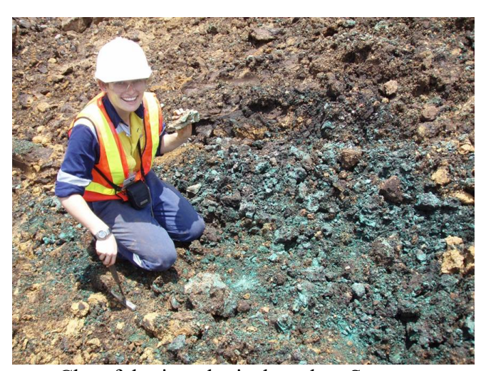
Cheerful mineralogical work at Sepon