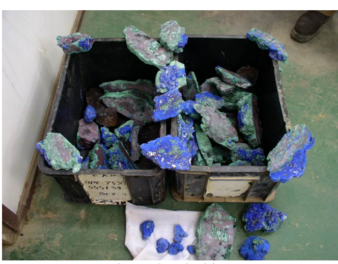
Azurite and malachite