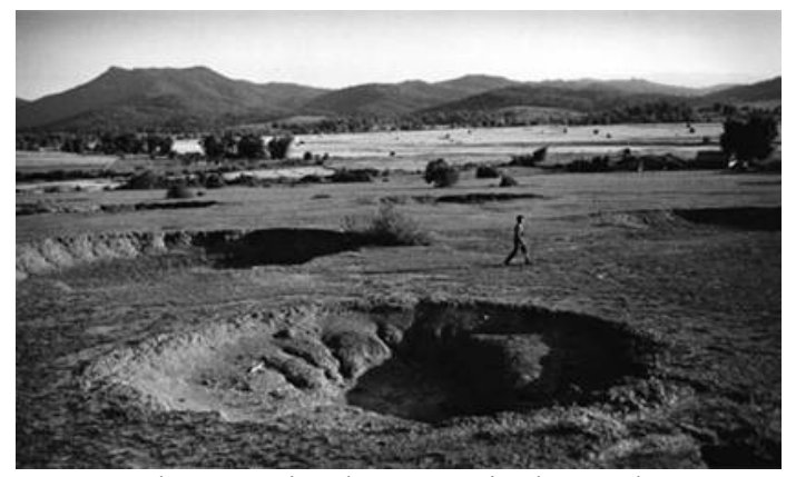
Bomb craters in Phonsavan in the northern mineralised area of Laos

Laos is a small country with a population of about six and a half million people. It is one of the five remaining countries identifying themselves as communist. The Sepon gold mine is situated in the Savannakhet Province in the south-east, almost on the Lao-Vietnamese border and is in an area referred to by the Americans in Vietnam over the Vietnam War period from 1964 to 1973 as the so-called 'Ho Chi Minh trail'. Accordingly the area was subjected to extremely heavy bombing by the U.S. Air Force with 2.5 million tonnes of bombs and 'sub-munitions' (cluster bombs or bomblets) being dropped over 580,000 bombing missions equivalent to a planeload of bombs every eight minutes, 24 hours a day, for nine years. This is more tonnage of bombs than were dropped on Europe throughout World War II and has provided Laos with the unfortunate distinction of being the most bombed country in the world per capita.