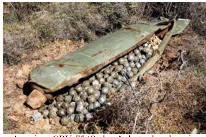
American CBU-75 'Sadeye' cluster bomb casing with 1,800 bomblets

During the Vietnam War the US Government spent nearly US$17 million per day bombing Laos but since 1974 had been spending only US$2.7 million annually on UXO clearing and this expenditure was reduced from 2011. A few images were shown of some of the UXOs, notably the cluster bombs, cases which would open before impact with the ground and scatter 1,800 one-pound bomblets.