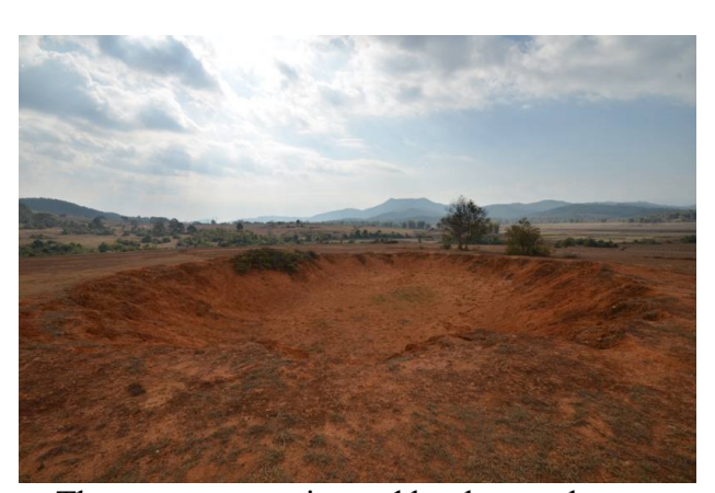
The same crater pictured by the speaker

The speaker indicated on a map the extent and bombed density of areas in Laos with Sepon being located in one of the two most heavily bombed areas. The other area in the north also bears mineral deposits and coincidentally these two most heavily bombed areas are also the only ones in the country with economic mineral deposits. Unfortunately a large proportion of the American munitions failed to detonate with up to 30% or about 80 million unexploded cluster bombs remaining in or on the ground and today over 40 years after the war, less than 1% of these munitions have been destroyed or removed. Ten of the eighteen Lao provinces have been described as still severely contaminated with more than 20,000 people killed or injured by Unexploded Ordnance (UXO) incidents since 1974 or an average of about one person being killed per day.