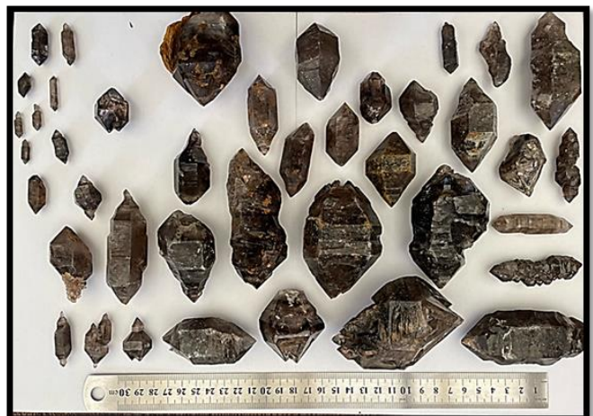
A great collection by Dioni – note the 30cm scale