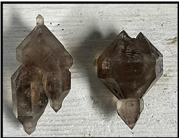
Dioni's multi terminated crystal specimens