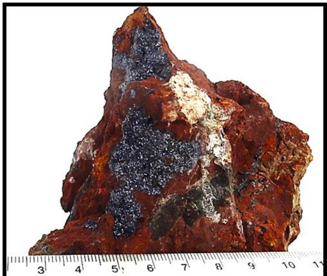
Rare glittery metallic Chalcophanite in matrix