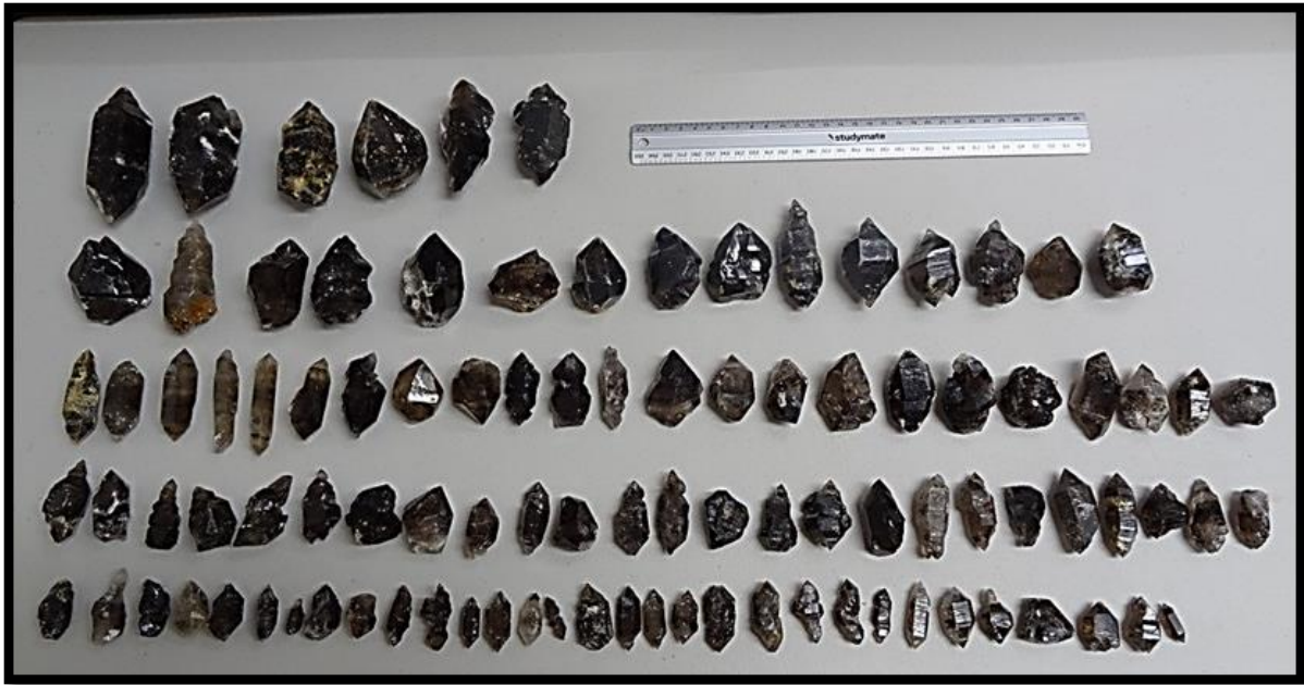
Denis's collection of specimens