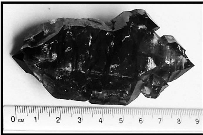
Denis's multi terminated crystal