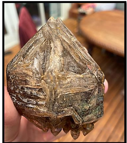
Dioni's splendid hopper quartz crystal