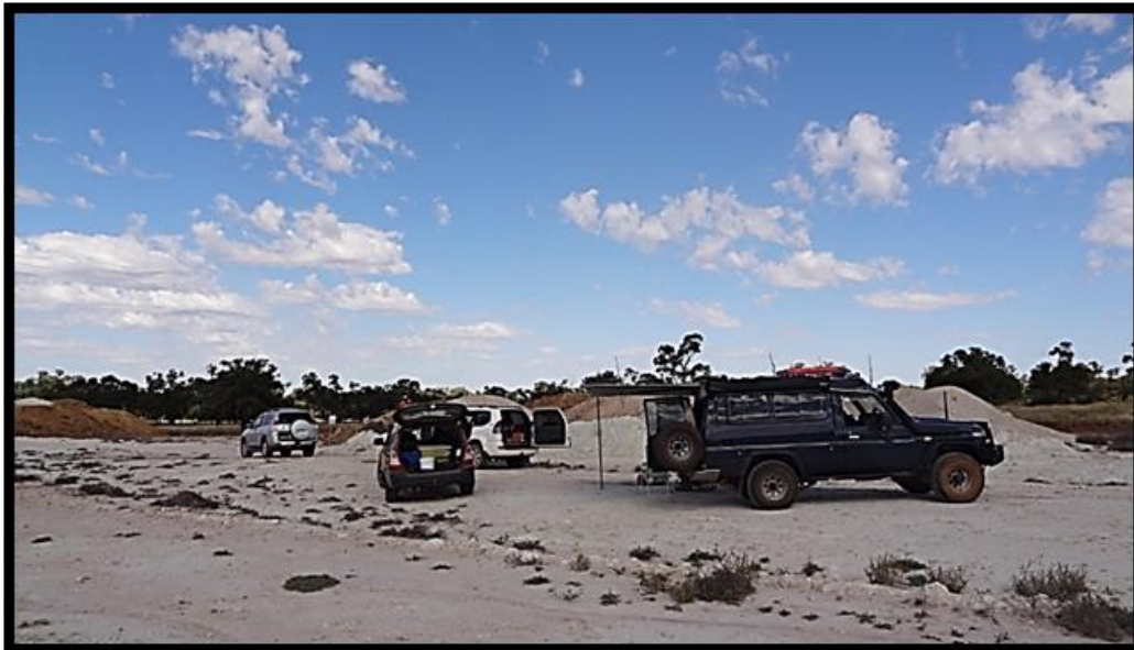
Lunch break at the central dumps – note the white clay.