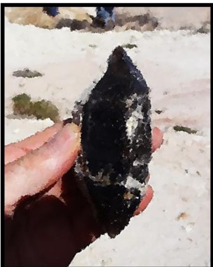
A large black double terminated crystal