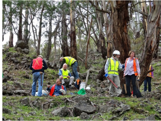
Mt Tennyson Mammoth Mine area