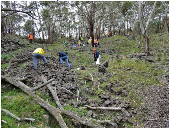
The dumps below Mt Tennyson