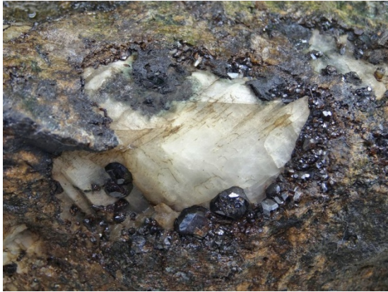
Mt Tennyson Andradite on calcite

We thoroughly enjoyed the weekend, although our legs are paying for it today. Although I haven't gone through the material that I bought home yet, I'm happy with what I collected, especially from Mount Tennyson, where I mostly found garnets.