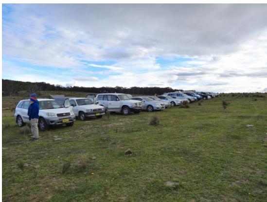
Car park at Mt. Tennyson

In particular, I found one piece that has a calcite pod approx. 40 mm across, surrounded by visible garnets (I've attached a photo) – hopefully it will be a nice specimen once I etch out the calcite. I only found a few small pieces of malachite and some micro quartz coloured with copper mineralisation at Essington, but again it was worth the visit. The dinner at the RSL was a great idea and we thoroughly enjoyed the night.