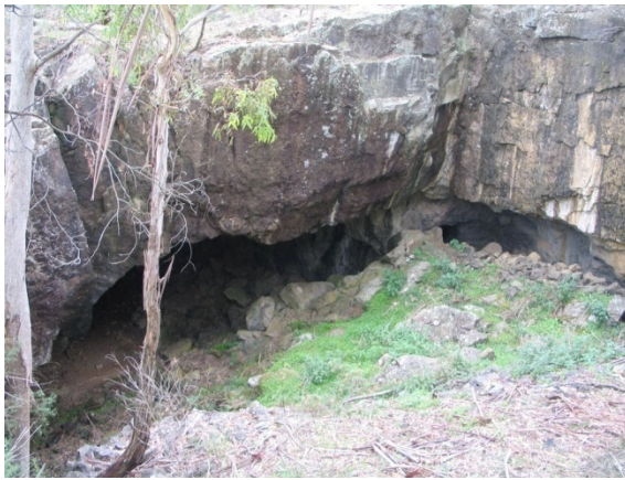
The open cut and entrance to the Mammoth Mine

Frank and Gertraud Godeny sent in the following pictures: