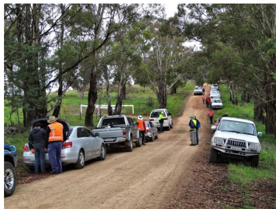
Car park at Essington