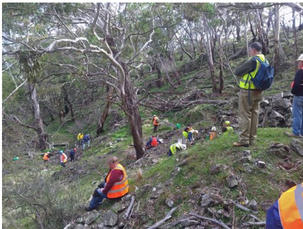
Mt Tennyson - colour on the slopes