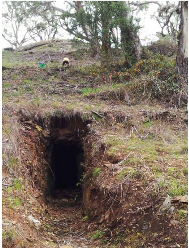
Cash Essington adit