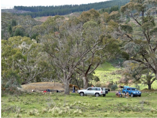
Cash Essington Mine