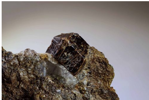
Mt Tennyson Andradite

The skarn rock proved remarkably resilient to hammering, seeing the demise of my sledge within 10 minutes (note to self buy a better quality hammer). However, soon most of us started finding andradite garnets of various sizes up to 25mm (not perfect, but quite nice), with patches of molybdenite and diopside also showing up. A few UV lamps were used under various forms of clothing to reveal both blue-white and cream-white fluorescence under SW