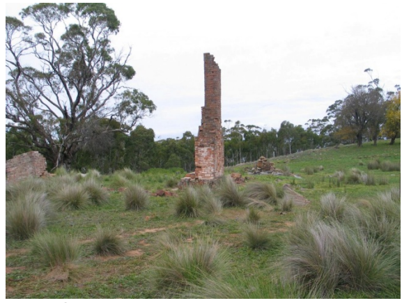
The Chimney, when sighted, gave us the direction to find the mine site.