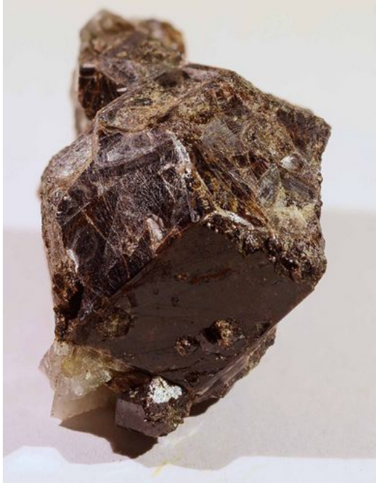
Mt Tennyson Andradite

The weather could not have been better as a caravan of 25 or so cars descended on the property that many of us had been wanting to visit for decades. However, finding the actual mines of Mt Tennyson was not as straight forward as we had hoped, but after an hour of rather pleasant rambling through the Yetholme country side with stunning views over the Oberon Bathurst area, dumps were spotted amongst the trees and soon 36 fluoro vested mineral collectors were hard at it.