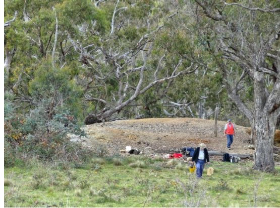
Cash Essington Mine