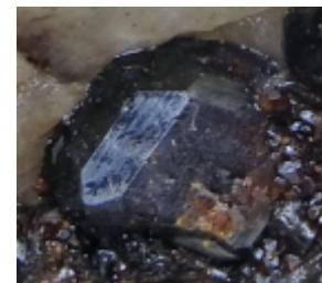
Figure 1 Mt. Tennyson Andradite

The adit into the open cut was a worthy climb. The open cut was a 20 metre diameter hole and about the same depth. Walls were shear drops with only the eastern side being terraced in 2 metre steps. A bed frame and table were remnants of prior occupancy. A large cavern opened up on the