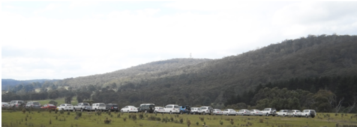
Mt. Tennyson – the member's cars lined up

I can certainly make a number of comments although no doubt similar to everyone else. From compliments to the organisers for all your work, the amount of preliminary 'reccé' work, checking access, permits, routes etc etc, everything you and Peter had to do. Fairly comfortable weather for the trip, wet overnight but fairly bright during the days. Comfortable