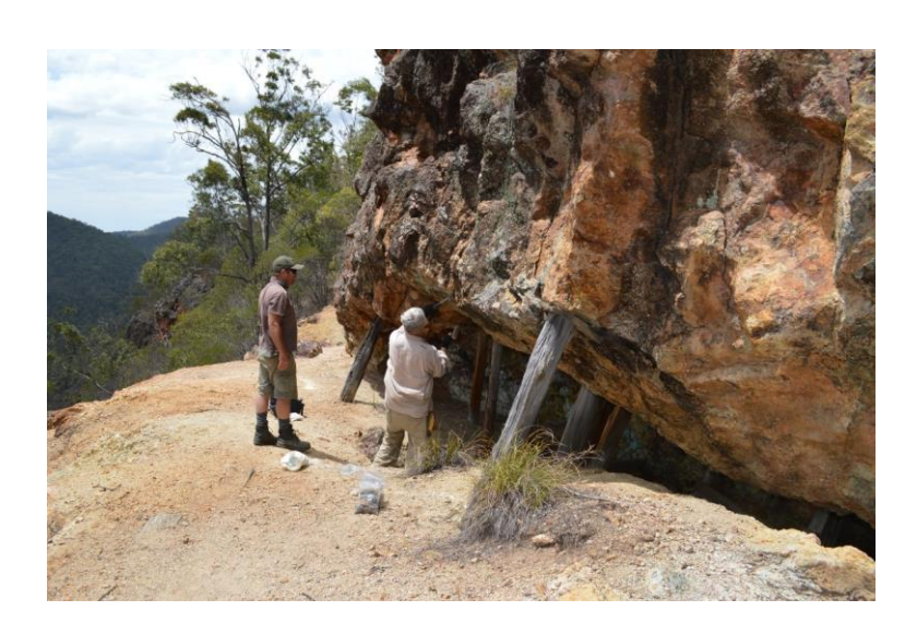
Ian Graham and Brett Nagel collecting linarite samples from the Northern adit looking south.

With the aid of projected images Angela Lay described at some length the examination of the old workings at Red Rock where the researchers have been finding linarite noting that there were several previously worked areas, old adits trending north and south and referred to as the north, central and south adits. The north adit has produced the best specimens. Overall the Red Rock minerals comprise a range of sulphate, sulphide and carbonate minerals and are hosted within a quartz sandstone. Associated minerals included brochantite, anglesite, cerrusite, clinochlore and quartz. Further images displayed a number of the specimens found and the workings where they were located.