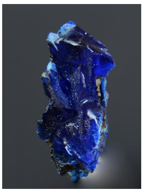
Linarite. Dieter Mylius specimen